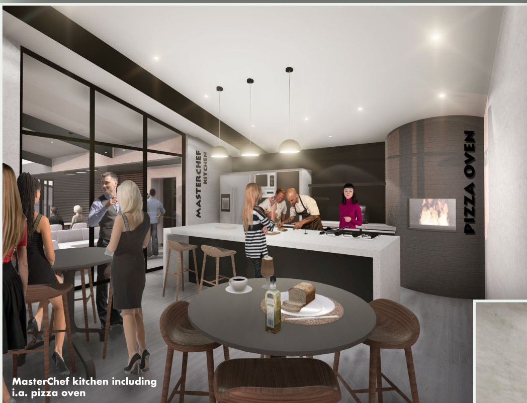
MasterChef kitchen including i.a. pizza oven