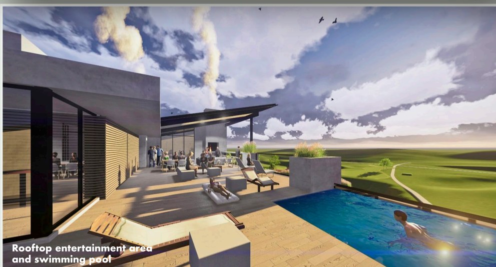
Rooftop entertainment area and swimming pool