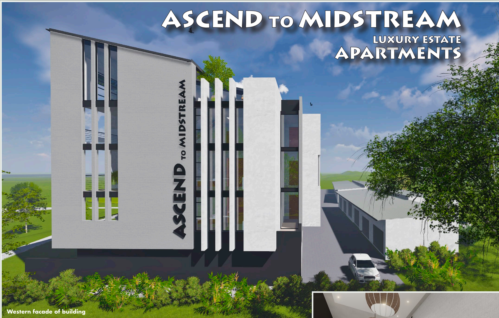
Western facade of building

It combines the freedom, outdoor lifestyle, security and space of estate living with the convenience, luxury, easy-living and lock-up-and-go lifestyle of luxury apartment living.