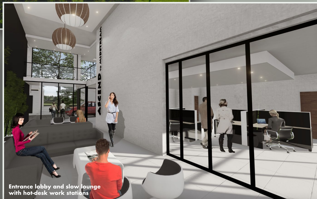
Entrance lobby and slow lounge with hot-desk work stations