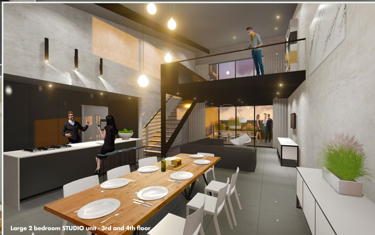
Large 2 bedroom STUDIO unit - 3rd and 4th floor